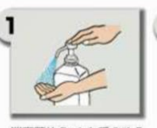
Spray about 3ml of hand sanitizer into your hands (1 pump is enough).