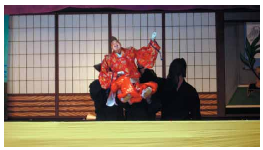
Ebisu - god of fishermen and fortune doing his dance

The stage building was a long narrow rectangular structure made of wood, shed like in appearance it opened out towards the audience. The audience was seated on