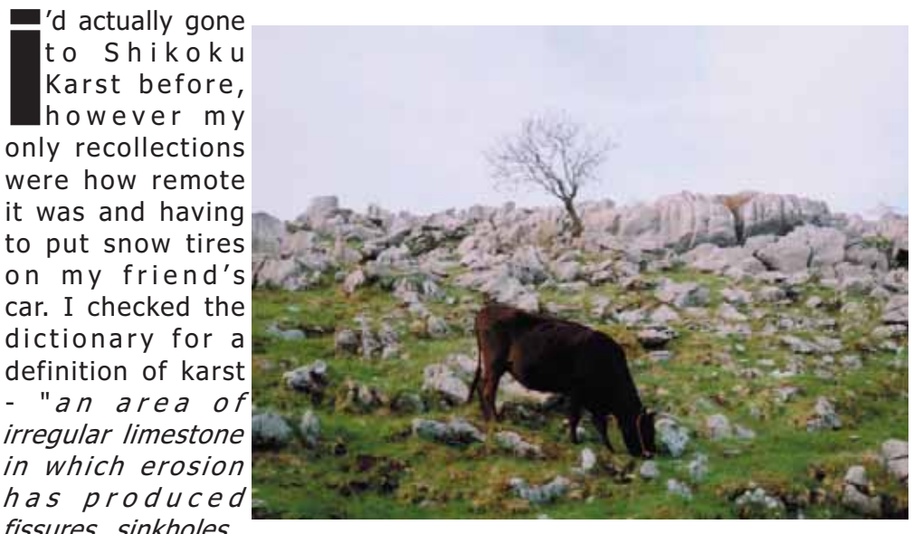
local karst ice cream producer

Following dinner we went to the nearby Ishizuchi Onsen to wash. Despite a luxurious