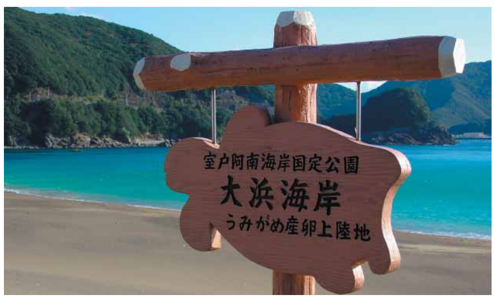
signpost for Ohama beach in Hiwasa