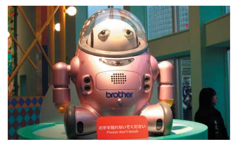
Brother corporation's sleepy robot

In Global Common 3 most of the European countries were exhibiting. I visited the Spanish exhibit which was excellent however by that time I was suffering from Global pavilion fatigue so I decided to check out some robots. I visited the Nedo Pavilion which showed a 3D film about robots and other future technologies. It was pretty boring, and the 3D technology was of the old jittery and blurry variety. Not