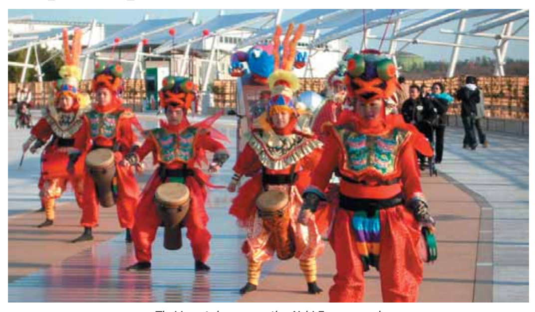
Thai insect dancers on the Aichi Expo grounds

by martin o'brien martinobrien2004@gmail.com