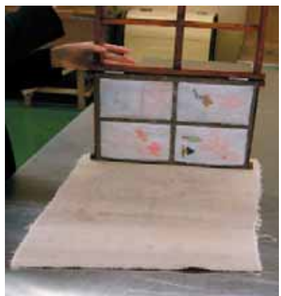
tap the mold so the dried pulp falls out onto a mat

4. Use the extractor dryer to remove excess water, then open the mold and use a towel to dab away any remaining moisture. Tap the mold so the dried pulp falls out onto a mat and then press the pulp between two mats to further remove moisture.