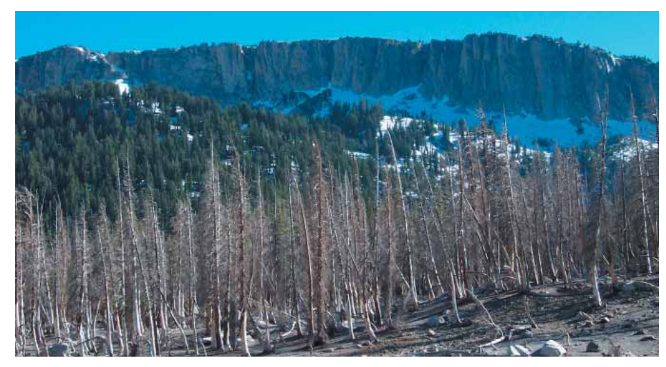
when trees in a large group stop growing at the same time, a natural disaster may be to blame. Brian Atwater first suspected seismic activity in Oregon when he discovered a dead forest.

SU-NA-MI. If there was anyone in the world who hadn't heard this Japanese word before December, they now know it all too well. The news from Southeast Asia has shaken the world at large and needs no sensationalizing: a 9.0 earthquake, 15 meter waves, and 175,000 dead. After we swallow our surprise that a catastrophe of such magnitude really occurred, we're still left with the surprise that no one saw it coming - that such a thing can catch us by surprise at all.