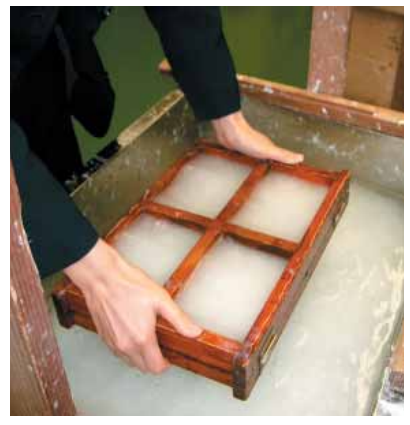
lifting the mold out of the vat

desired thickness shake off the excess water and lift the mold out of the vat.