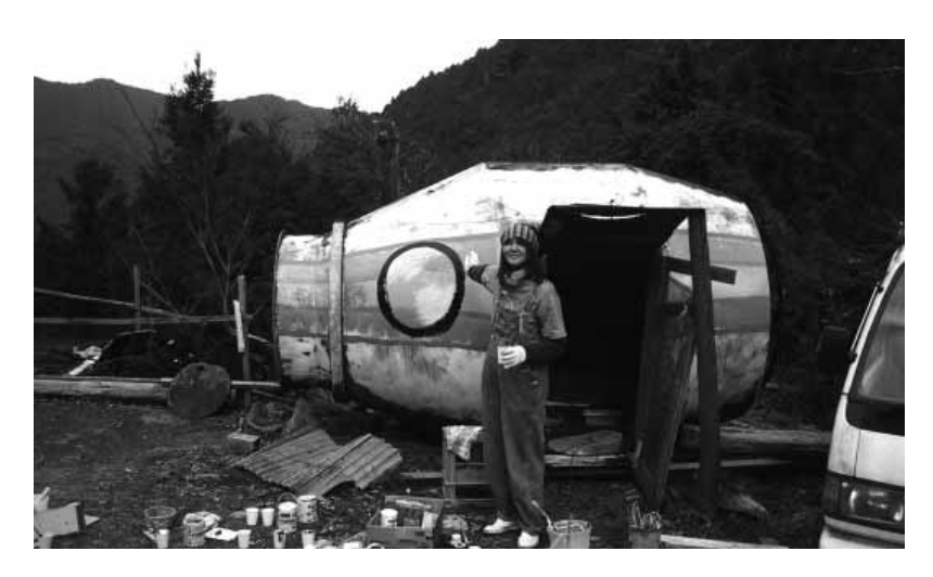
Local artist turns a cement mixer into a spaceship