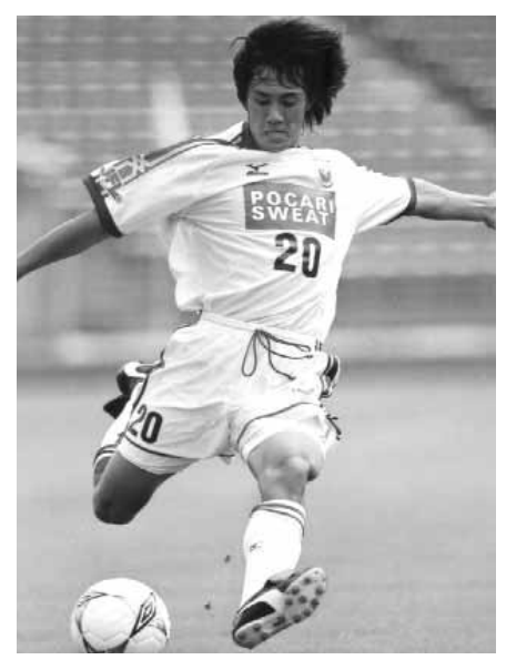
Otsuka FC in action

ocal team Otsuka FC have won their final game of the season and are champions of the Japanese Football League (JFL) and will now be promoted to the J-league Division 2. Otsuka is the name of the pharmaceutical company that are the teams sponsors and for most of the teams history the company name has been incorporated into the actual name of the team. However the team will play under the name "Vortis Tokushima" when they start participating in the J-league. I was lucky enough to be able to attend the second last game of the season which was won by Tokushima. The second last match of the season was the first time I attended one of Tokushima's games. It was a home game played in their Naruto stadium. Tokushima played against neighboring team Ehime F.C. The influence of Otsuka pharmaceuticals in regard to the sponsorship and organization of the team was obvious. The companies' factories loomed in the background and there were many sales persons promoting the companies' products outside the stadium. We even parked in a car park that was owned by the companies' factory. The strong corporate influence on every aspect of the team is somewhat unique to Japanese sports teams. Otsuka FC is no exception. The atmosphere in the stadium was very friendly (someone gave us free tickets for next weeks match) but at the same time it lacked the atmosphere of a soccer match in my own