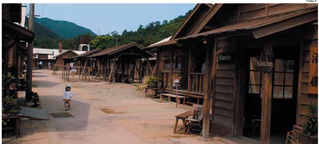
a row of buildings in the bando set for baruto no gakuen , including barracks, a bath house and even a bakery (unfortunately for display only)

Baruto no Gakuen opens nation-wide on June 17. Now is the perfect time to take this unique opportunity before seeing the film, and it certainly does make for a rewarding experience.