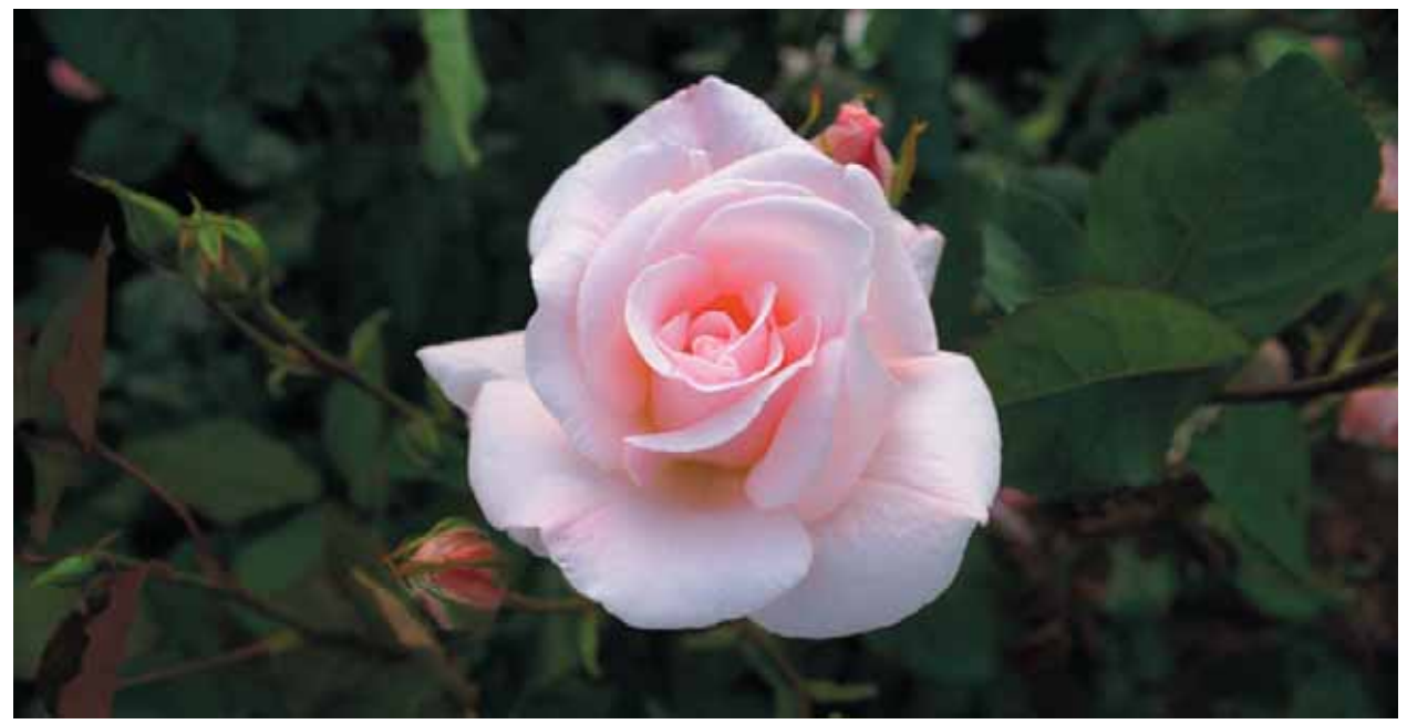
the rose - symbol of romance and love. the roses of tokushima city central park are now in full bloom, and make for a spectacular sight