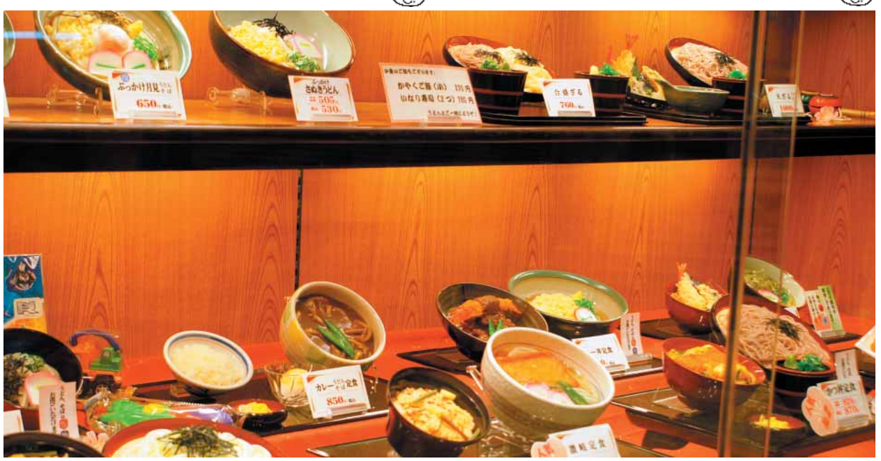
displays of plastic food like this outside of restaurants are common in Japan, and are a helpful way to make your choice when you're unsure of the items on the menu. There are even companies that specialise in the creation of this kind of food, and can have a very hefty price tag!

ell, the sakura have come and gone, and Spring is finally here. As I write this, the flowers by the roads near TOPIA are in full bloom, and the trees are sporting a healthy green. I can't remember having ever experienced a winter quite like the one we have just come out of, and spring is a welcome sight indeed. Now, in May we have the wonderful Golden Week holidays, and the temperature continues its upward (and very welcome) rise. The weather is just great for getting out and about, and I hope you make good use of this opportunity to enjoy some outdoor activities. I hope you enjoy reading this issue of Awa Life, and you have very a fun-filled May! Cheers, Andrew