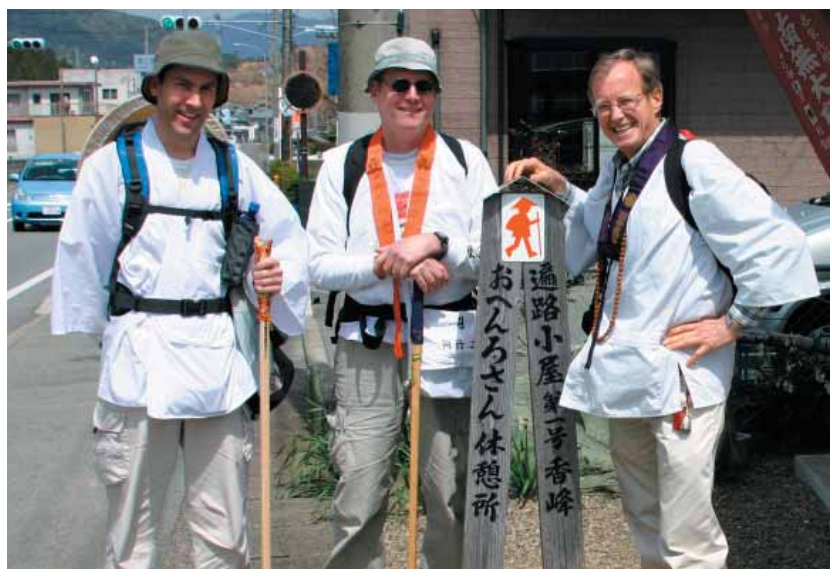
the three travellers on the trail of the shikoku pilgrimage

We began our journey at Sabase station – 90 minutes south of Tokushima along the Mugi line and finished at Cape Muroto. On the first day we walked about twenty-five kilometers and the next day, thirty-five. However, unlike the pilgrimage route from Temple 11, Fujiidera to Temple 12, Shosanji which goes through forests and up and down mountains, this section runs along Route 55 so, at times, the traffic was noisy