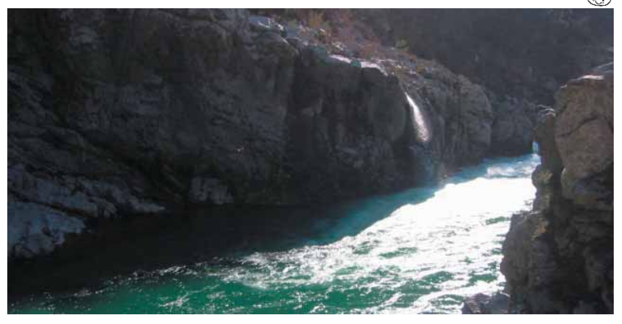
a section of the rapids in the oboke koboke gorge of yamashiro town

If going by public transport, you can reach the gorge by bus and train. By bus, it is a 37 minute trip from Ikeda station, and by train for 30 minutes from the Awa Ikeda station for ¥440.