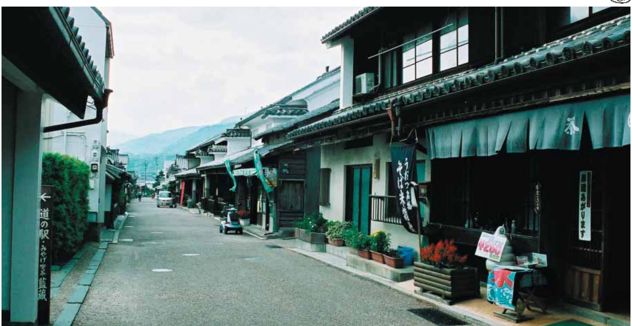
houses in traditional Japanese style in the historical streets of Wakimachi

How to get there: You can easily access the area by train, and it is only a 35 minute trip from Tokushima City to Anabuki station. From there, it is a 15 minute walk across the river and then follow it along left until the streets appear on your right. If going by car, head off the Wakimachi IC and follow route 193 for around 3km, turn right off on to route 12 and proceed for another 2km. Public parking is available close by for free.