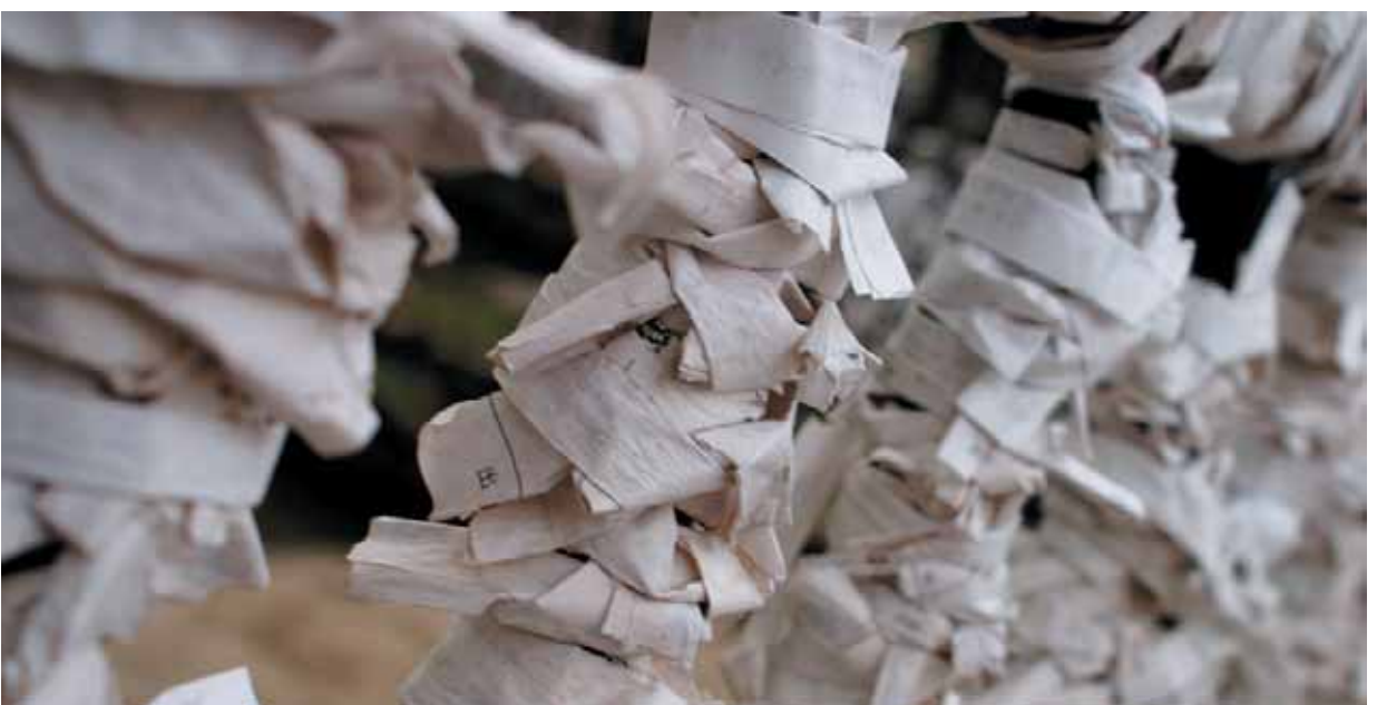
these pieces of paper are fortunes (omikuji) recieved from shrines - if you draw a bad fortune, you can tie it to a place within the shrine and pray for the gods to change your luck