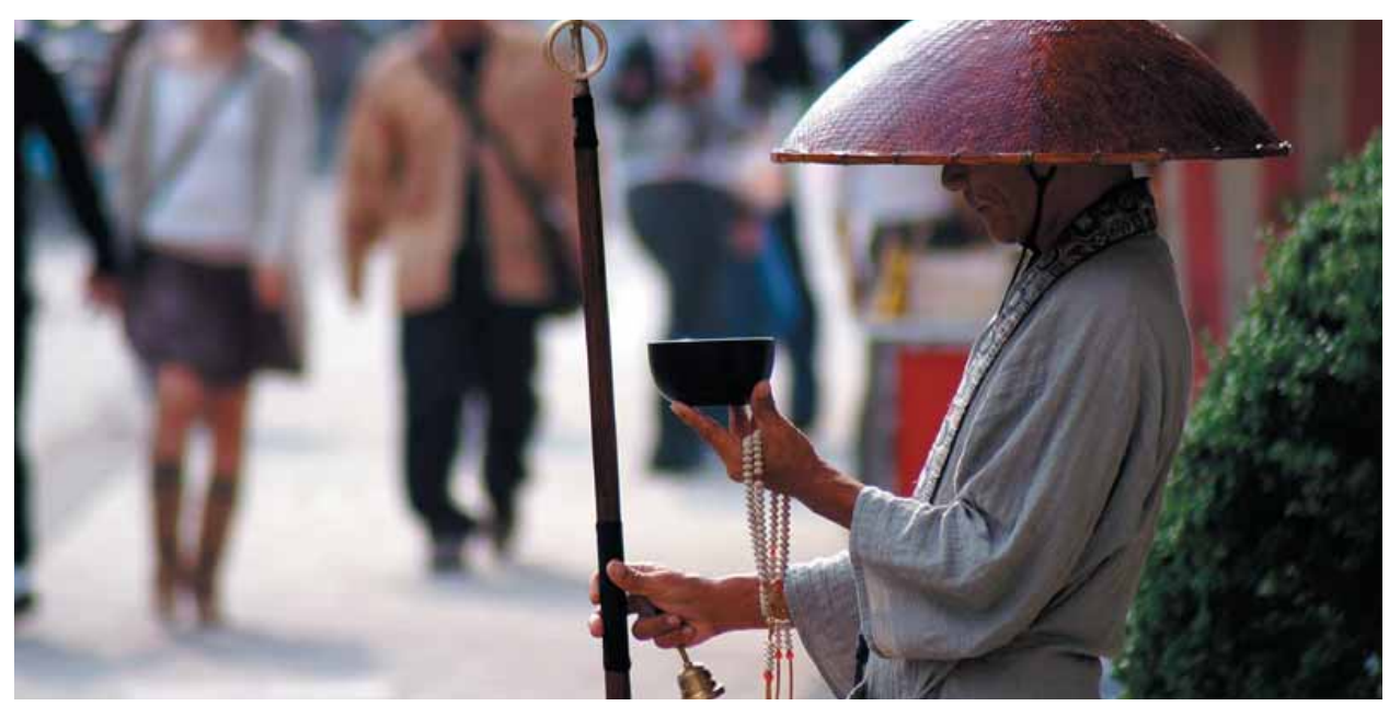
holding strong - even today the tradition of collecting alms is still in practice, offering a sharp contrast between the old and the modern