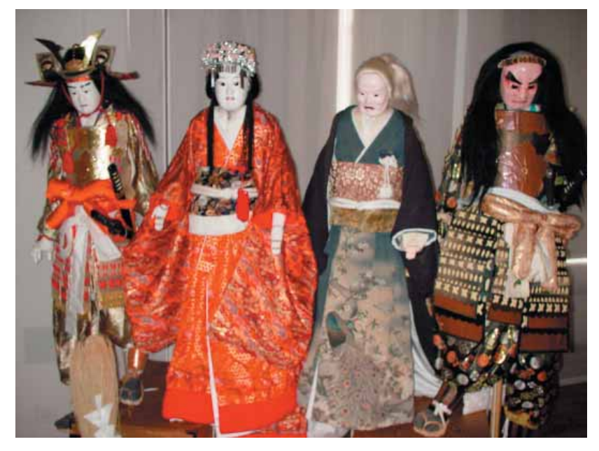
a small lineup of the dolls used in awa puppet theatre, wearing costumes as elaborate and well-made as the real deal

Hakomawashi is also a kind of puppet play. The puppets are carried in wooden boxes at New Year's across the whole country to bring good luck and happiness to everyone. Actually, we have an 'Association for Reviving the Hakomawashi Puppet Play' in Tokushima. Two women perform the show, one playing the taiko and the other performing with the puppet.