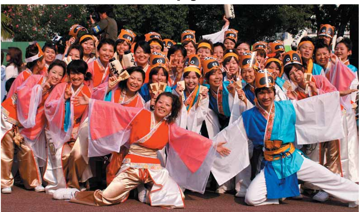
one of the many and varied dancing groups on show at the awa tanuki festival strikes a pose for the camera

For example, it is said in the Iya Valley that long ago a tanuki could be found near the embankment to one of the famous iya vine bridges. When people would try to cross here at night, the tanuki would confuse the travellers by making it seems as though the bridge had split into two, making it impossible to cross. It was also said that tanuki in