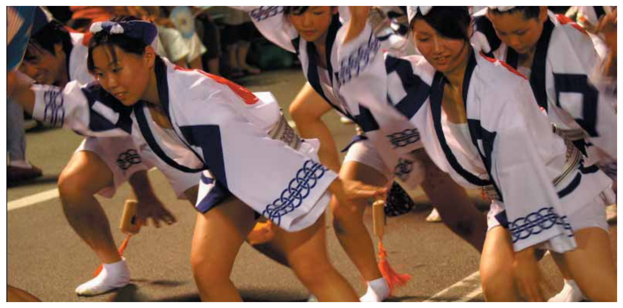
awa odori dancers burning up the streets of tokushima in the mid-august heat