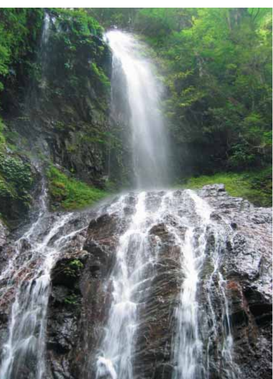
amagoi waterfall - jet to stream