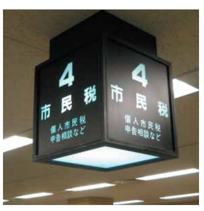
tokushima city tax department

If you earned 200,000 yen per month, your " 総 収 入 gross income of the previous year (12 months) will have been a total of 2.4 million yen. Your " 総所得 "net income will automatically be calculated as 1.5 million yen. Then, your 基礎控除額" basic deduction will be 330,000 yen from your net income, resulting in a " 讓 税 デ 得 " taxable income of 1,170,000 yen. If you have a spouse, children, dependents, or paid social insurance, life insurance, or casualty