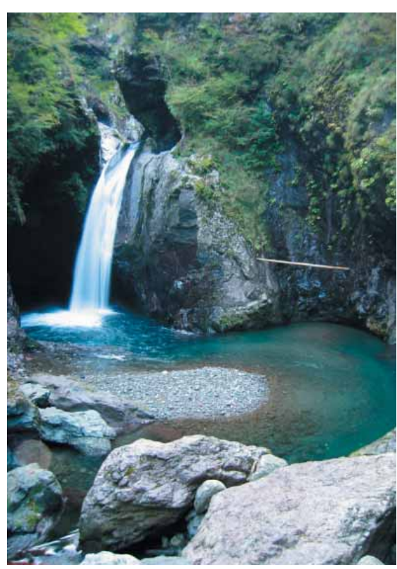
ogama waterfall - into the pot

vitality. Who knows? Maybe this rumour is true- I always feel refreshed after visiting a waterfall.