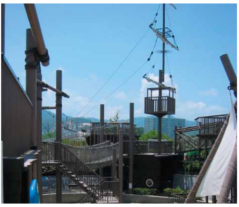
naruto uchinoumi park pirate play area

Overview: Tucked behind Naruto Educational University, this expansive park is perfect for large groups. Opened on June 1, 2003, it's also one of