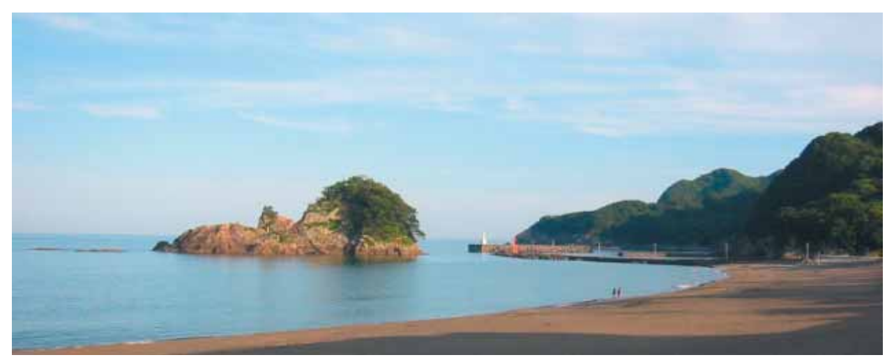
view to the south from hiwasa's ohama beach

Chelonian Museum tells the history and biology of these shelled wonders in a concise visual presentation. Don't miss the tanks with baby turtles and the outdoor pools. The museum monitors the beach and you can get updates about the latest sightings. Look for telltale mounds of sand halfway up the beach during the egglaying season from Mid-May to mid-August, but please don't disturb them.