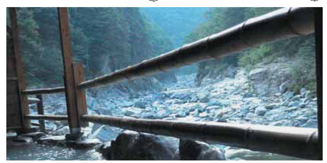
a view from the iya onsen outdoor baths, away through the iya valley