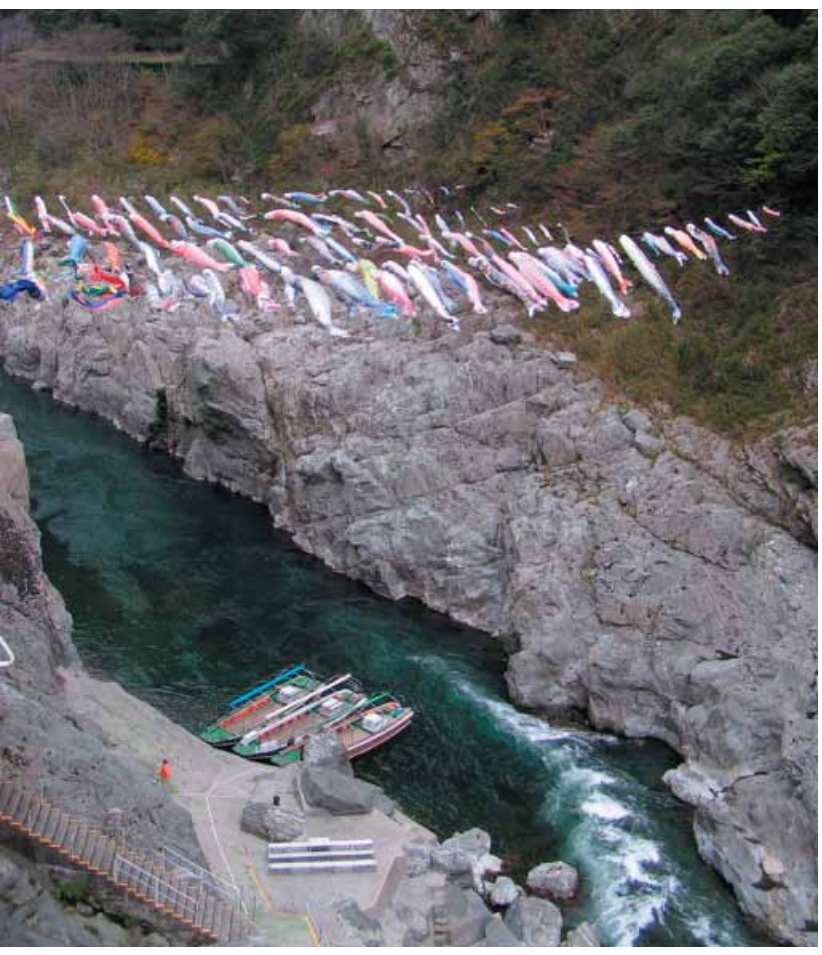
koi nobori over the oboke gorge, miyoshi city

When set alongside dolls in armor and samurai helmets, a fish may seem a strange bedfellow in celebrating this tradition. However, the reason behind this is that koi are a popular symbol of strength, admired for their ability to swim upstream in even strong currents. Taking after this, families with young