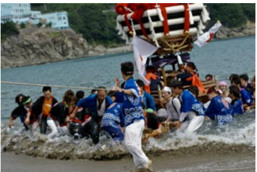
local townspeople fight to keep a portable shrine above water as they wade through the waves and into the surf

And they looked tired. Reaching the surf, the