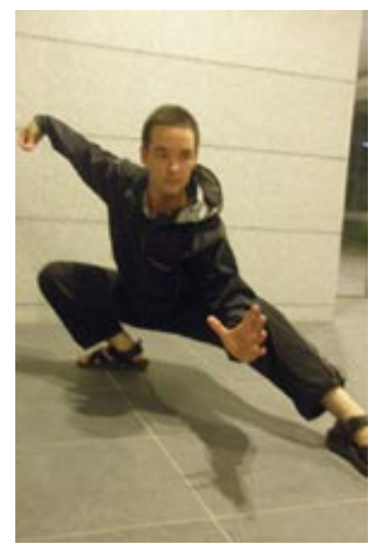
"single whip low form"

Through correct training, the Tai Chi fighter develops the ability to intercept, interpret, neutralize and control the opponent's energy without resisting. Because of this, Tai Chi has also been referred