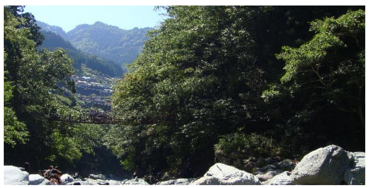
under the iya vine bridge "kazura bashi"