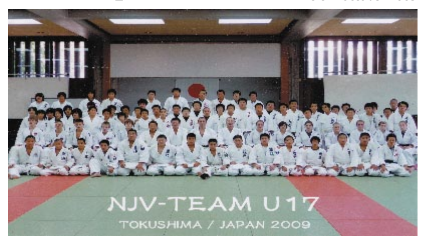
official delegation picture, taken in the tokushima chuo budokan

October 15: Dear Diary, we met at 9am (after the extensive breakfast) for a run