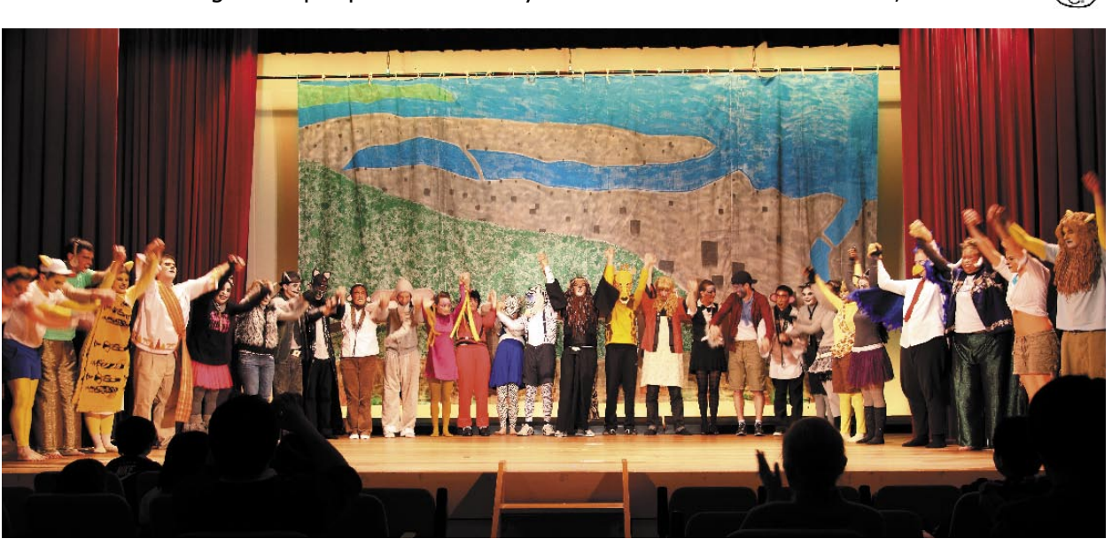
all together in the 16th tokushima ajet musical "the lion king"