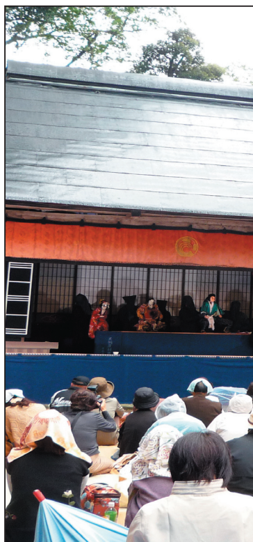
A puppet theatre farmhouse stage